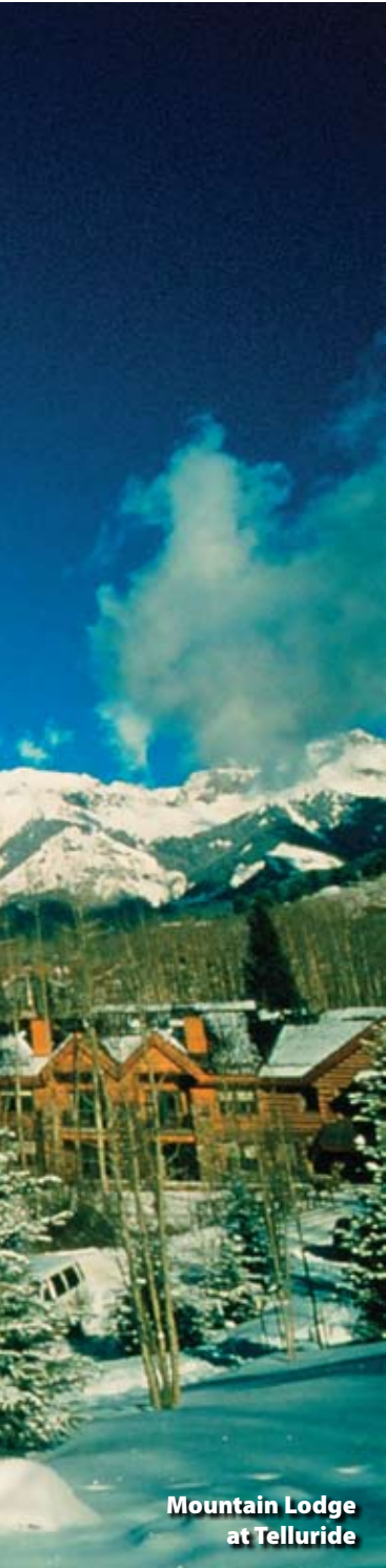
Mountain Lodge at Telluride