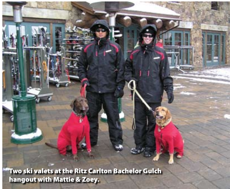
Two ski valets at the Ritz Carlton Bachelor Gulch hangout with Mattie & Zoey.

The Mountain Lodge at Telluride is ideally located midway up Telluride Mountain in Mountain Village. Surrounded by panoramic views of the majestic San Juan Mountains, the Mountain Lodge at Telluride features three log-and-stone buildings and a main lodge, whose tremendous lobby