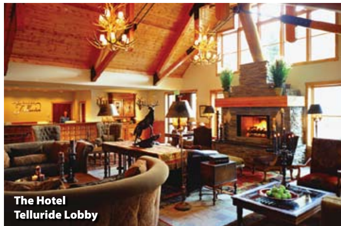
The Hotel Telluride Lobby

Each of The Hotel Telluride’s 59 beautifully appointed guest rooms